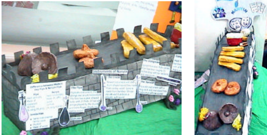
Figure 4. Models of Nanyin Instruments