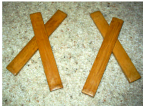
Figure 1. Sibao (a Nanyin percussion instrument)