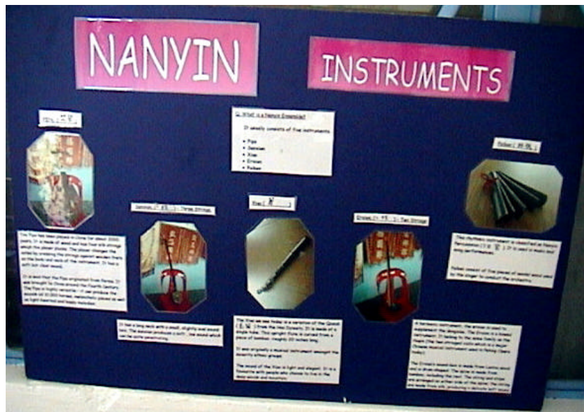
Figure 5. Pictures of Nanyin Instruments