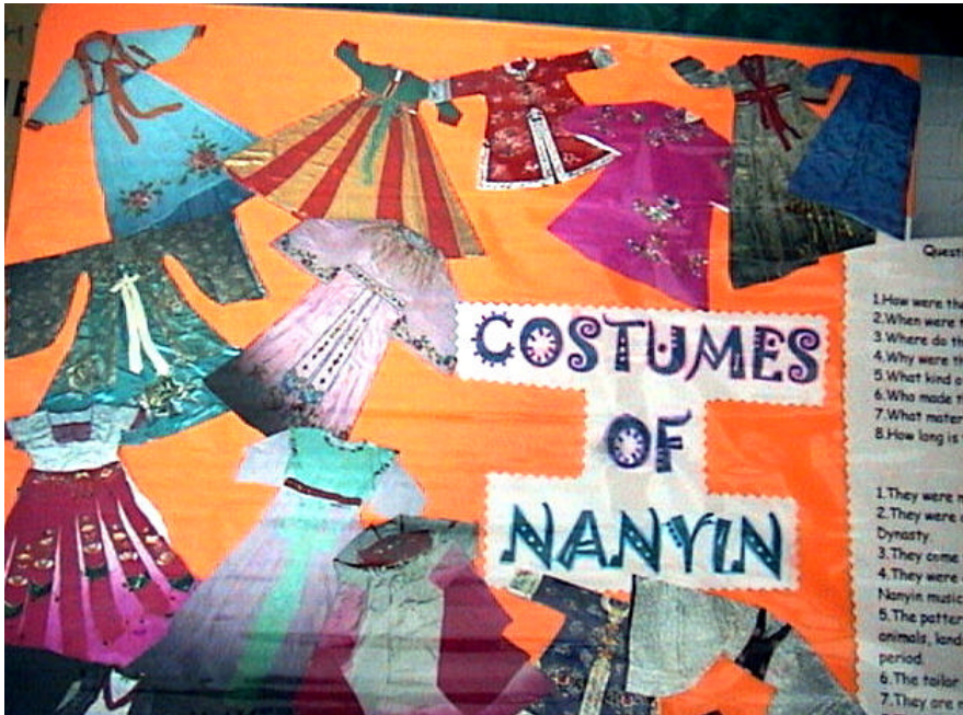
Figure 2. Costumes of Nanyin