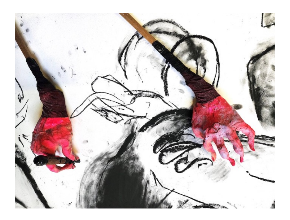
Figure 8. Collaborative LDP drawing, 2024.

In a previous research project, I posed the question 'how would I teach a puppet to draw?' (Platz, 2021). This question followed the rote academic propositions constantly circulated in university staff meetings: 'What should we be teaching?'; 'How should we teach?'; 'Should we teach life drawing?'; and 'What drawing skills should we teach for