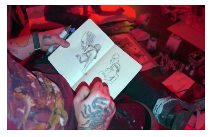
Figure 5. Adam Southgate, LDP drawing, 2024.

Whether describing anthropological studies of Mande sorcerer-blacksmiths or Liberian tailors, Lave contended that learning transcends the simple transmission of craft-knowledge (and economic expansion) from one generation to the next. In Lave's (2019) words, it is not "direly dualistic" (p. 67). Lave (2019) also resisted the mapping of master/apprentice relationships onto teacher/student relationships, arguing that the social matrix of schooling is fundamentally unlike the social matrix of apprenticeship. Lave's (2019) core critique was consistent: learning transcends the transmission-focused model of one who does not know becoming one who knows because of one who knows. Lave (2019) argued that we are all learners and occupy the middle between knowing and not knowing in one way or another.