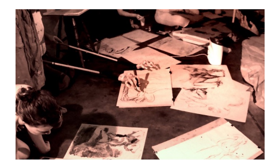
Figure 7. Georgia Hoskinson drawing in the LDP, 2024. Image courtesy of the artist.