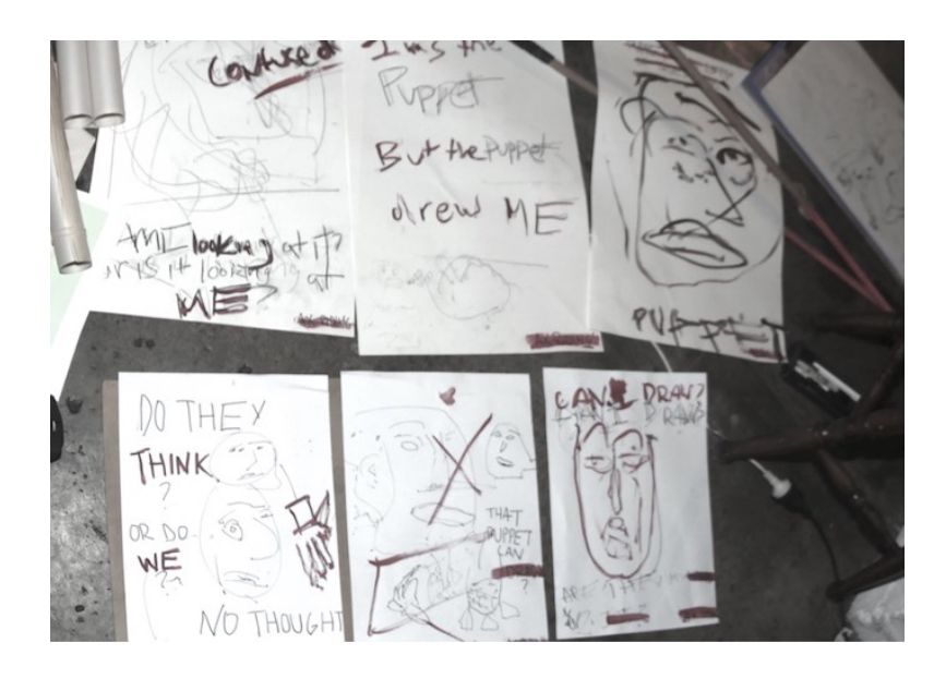
Figure 6. Alessandria Riding, LDP drawing, 2024.

Learning-focused frameworks assert that metrics of knowledge (and their attendant credentials) don't support socially situated differences in practices (Kemmis & Edwards-Groves 2018; Lave 2019). As a lecturer in drawing who teaches in the life studio, I acknowledge that every student knows things about drawing that I don't know. In the life studio, in particular, learning is a dynamic exchange occurring not only between teacher and student or those that are drawing, but also between the models and artists. In ex-academic life studios, the concept of the 'master' is abstracted—present and absent as a construct in the mind of the participant. Those who draw have no formal authority to address (either affirmative or rebellious) other than the models and organizers and thus the transmissive master/student circumstance handed down through the canon is undermined. In the LDP, the boundaries between pedagogical roles are further destabilised by the introduction of the draughtspuppets, whose motivations and experiences are distinct from typical educational exchanges.