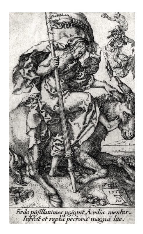
Figure 12. Heinrich Aldegrever, 1552, Acedia from the Vices, engraving.