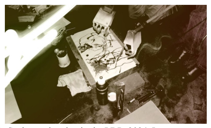
Figure 2. Ella Senbruns drawing in the LDP, 2024.