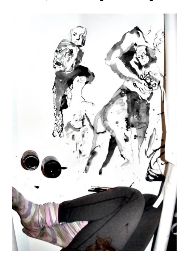
Figure 10. Chloe Healy-Johnson, LDP drawing, 2024.