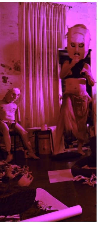
Figure 1. LDP Draughtspuppets, 2024.