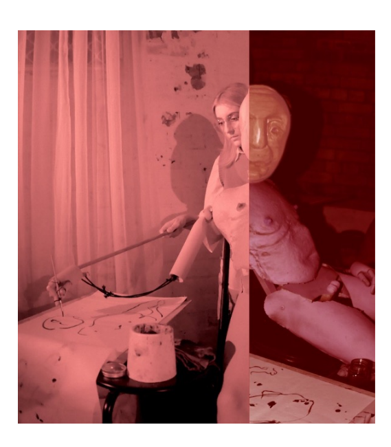
Figure 3. Kate van Bruggen drawing in the LDP, 2024. Image courtesy of the artist.