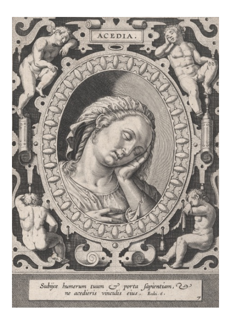
Figure 11. Hieronymus Wierex, c.1612, Acedia, engraving.

prescribed, more ubiquitous and exempt from specific dogmas or beliefs in demons and evil spirits.