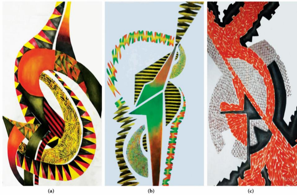
Figures 2. Samples of the students' stencil abstract artworks based on overlapping patterns and textured surface techniques. Students' names: Salma Aoun, Afaf Abu Al-Enein, and Maryam Ali.