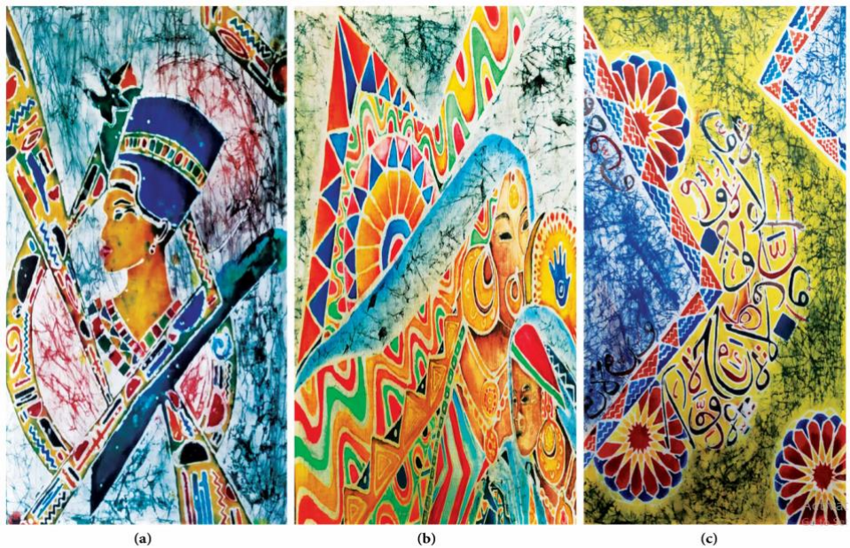
Figure 3. Samples of students' batik artworks inspired by the different forms of Egyptian heritage: (a) ancient Egyptian art; (b) Egyptian folk art; and (c) batik artwork inspired by Islamic art. Students' names: Esraa El-Ahmdy, Mawada Al-Fiqi, and Rawana Sherif.