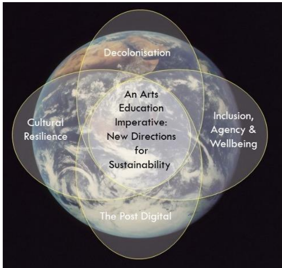
Figure 2. Intersecting Imperatives.

Phase 4 involved a process of further iterative and reflexive thinking. The challenge was to distill and synthesise these emergent themes into a manageable conceptual form. We developed a conceptually clustered matrix (Miles, Huberman & Saldana, 2014) to group and sort the emergent themes, which enabled us to identify four categories that we have described as “imperatives”. These imperatives characterise a global compendium of research in arts education occurring over the last two years. The representation in Figure 2 shows the imperatives, and attempts to capture how they overlap, connect and are interdependent and interrelated.