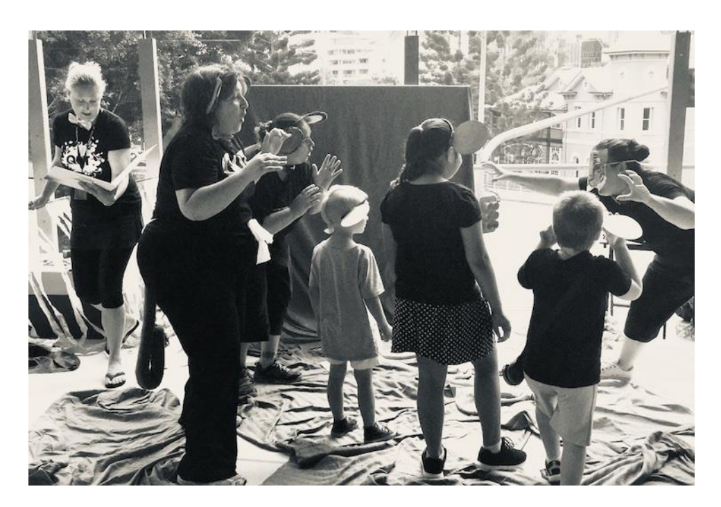
Figure 2. Student teams creating dance works with children at the Creative Currents festival.

The Creative Currents festival enabled the education students and children to work intergenerationally to experiment with diverse concepts of identity and urban citizenship. These rich themes allowed critical investigation of ideas and assumptions about bodies, identities, and urban communities and environments. The theme facilitated positive explorations of how and why bodies are different, and how these different bodies meaningfully contribute as citizens to urban communities. The theme explored the possibilities for belonging, living, dwelling in the city and the local environment, and who and what is a citizen? The intergenerational creative works imagined more-than-human citizens, where might they live, what would their neighborhoods look like? The children, hospital staff, and university students were moving together as they collectively learned more about identity and imagined these possible urban citizenships. A little after the festival children wrote reflections that captured the residual ideas and thoughts from the day. A particularly powerful reflection which read "My dream was to fly like a bird and it happened today" (Figure 3.) conveys the effectiveness of intergenerational movement for opening children up to big ideas about identity and community.