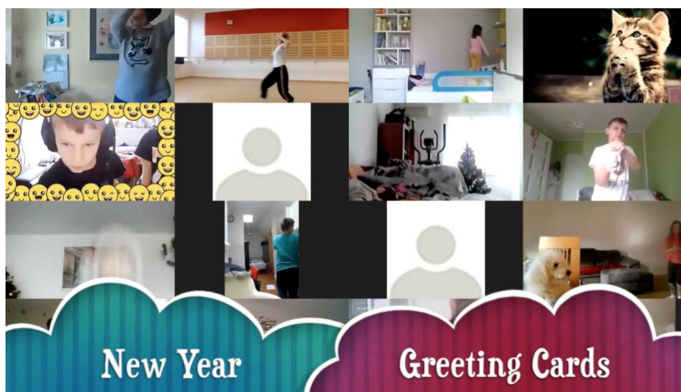
Figure 2. The video "New Year Greeting Cards" was created at the last distance meeting in December. Each child danced their own greeting card, the dancer filmed them via Zoom, and then combined them together into a complete video that became the class New Year's greeting. Video can be viewed at http://www.ijea.org/v23si1/v23si1.5-video-1.mp4