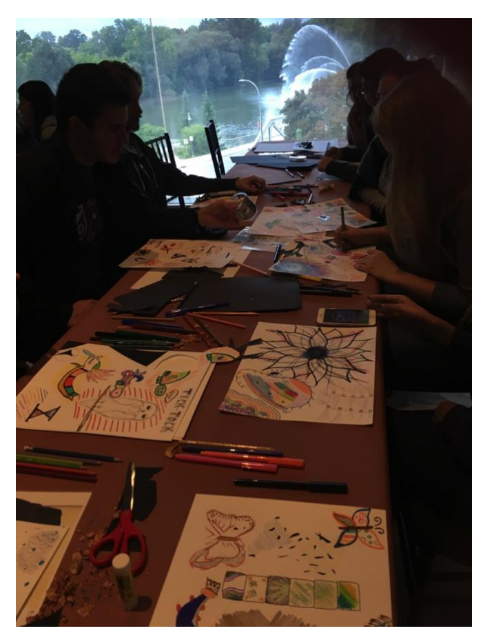
Figure 6. Group workshop in Museum London, October 1, 2016.

were quite flexible: we all started with a blank sheet of paper and needed to draw something. Some models of pre-Columbian motifs were provided to us, but many students used their own imagination. The idea was that after a while our drawing needed to be passed along to our neighbour who would continue our creation, and so on, for about two hours (Figure 6). At the end, we grouped our drawings together on the floor and tried to come up with a story. A student underlined this as her favourite part of the workshop activity, as it allowed her to see how far our design had come, along with the details that were added throughout the collaborative process. This creative activity in Museum London with Z'otz* Collective was much appreciated by the students, as it differed from the academic lectures and evaluations they are used to. It also allowed them to bond and learn from each other in a relaxed environment, each with their own abilities.