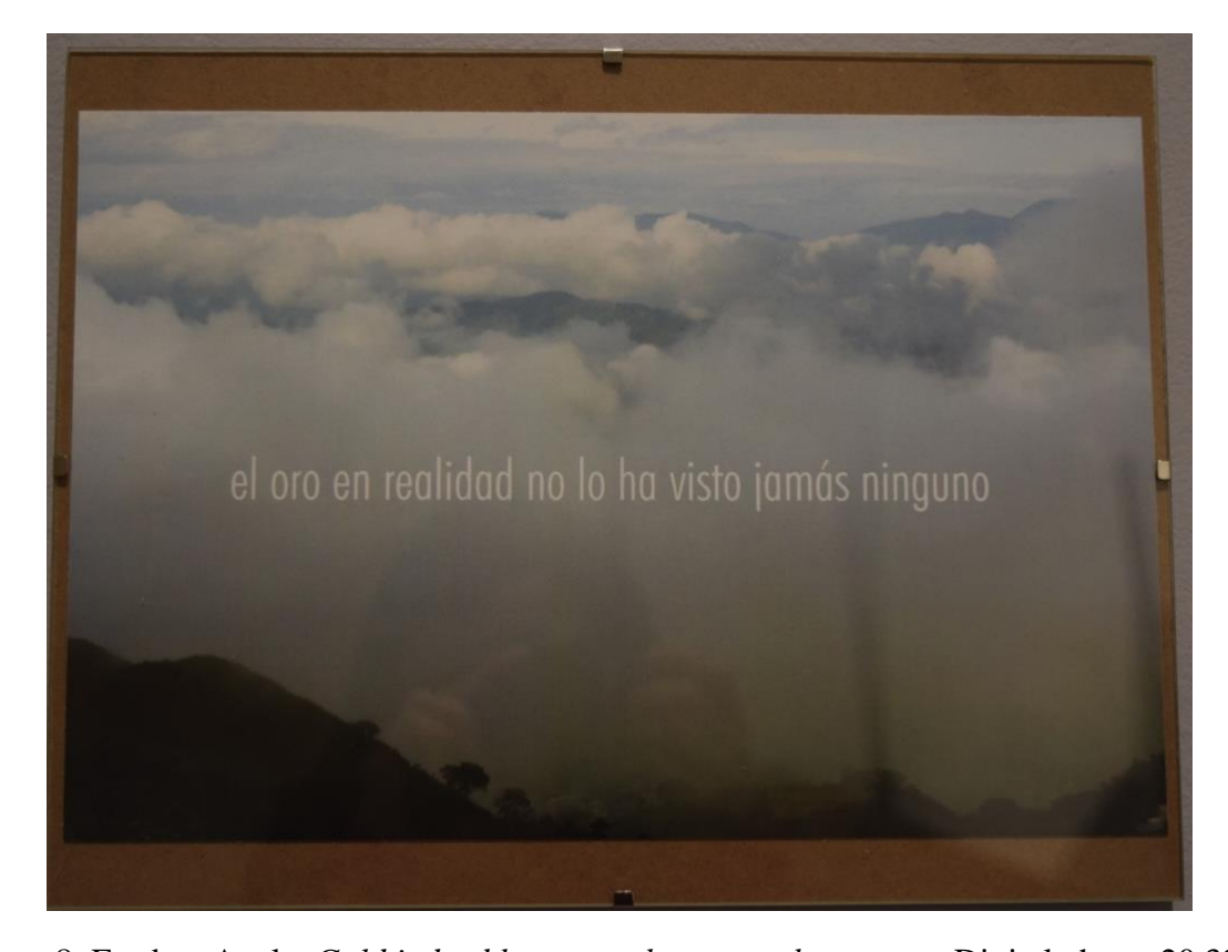
Figure 8. Esteban Ayala, Gold indeed has never been seen by anyone , Digital photo, 20.32 x 25.4 cm, 2015.

Patrick Mahon addressed issues of colonialism and local community in his installations, Ascending and Descending: Water Works/ Mountains (Figure 9).13 As they toured the community during the artist's residency in the summer of 2015, they witnessed remnants of the American presence separated from the local community residential area, structures, and buildings that changed functions through time and others that remained silenced, such as a cemetery and a swimming pool. While related to a not-too-distant past, they appeared out of context and invited another way of alluding to mining. The swimming pool was photographed and printed on Tyvek paper accompanied by plastic mesh. The visual effect produced by the light reflecting on the mesh creates an optical illusion that resembles the effect of the sun on water, and also changes according to the movement of the viewer. The PVC pipes arranged on the floor form a structure that alludes to the mountainous topography surrounding Portovelo, but also echoes the metallic structures of the swimming pool in the photographs.