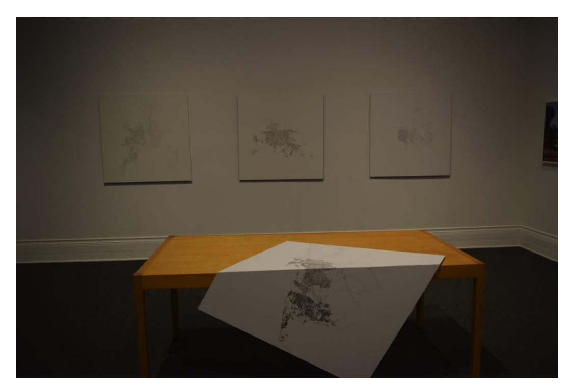
Figure 4. Manolo Lugo, Borders Towns.