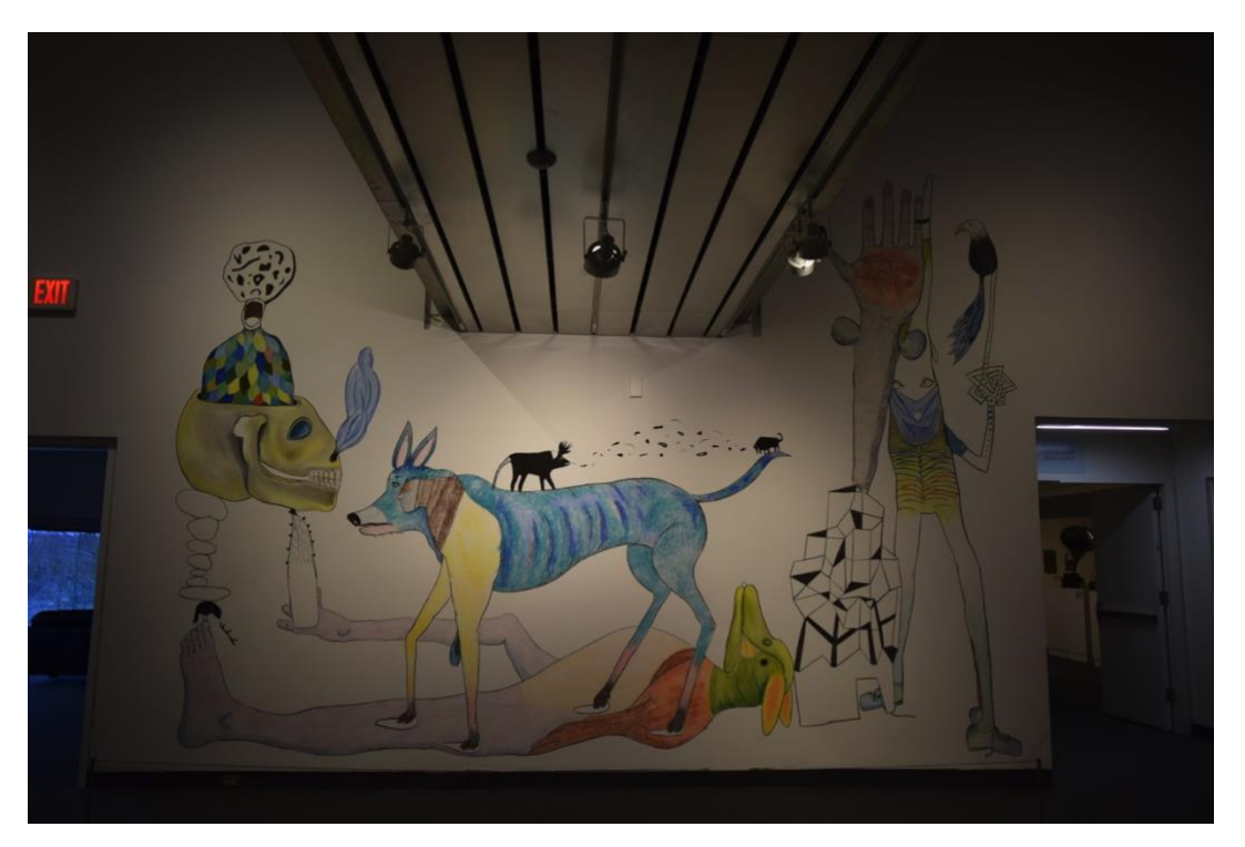
Figure 5. Z'otz* Collective, Mural Painting .

One student stated that he was not familiar with contemporary art prior to viewing this exhibition, yet he appreciated it as it opened new perspectives to him. Through Click! and the creation of Z'otz* (Figure 5) he learned that art could have a social purpose, that a team could collaborate and create something beautiful. However, as a native from a country in South America, he felt somehow excluded from the exhibition. If the purpose of the exhibition was to educate a general Canadian audience about issues raised by Latin American immigrants, then he felt the mission was well accomplished. However, he felt like a stranger in front of the concept of bridges and expressed that some typical elements of Latin America were somehow lost in the exhibition, while trying to appeal so much to an Anglo-Saxon public.