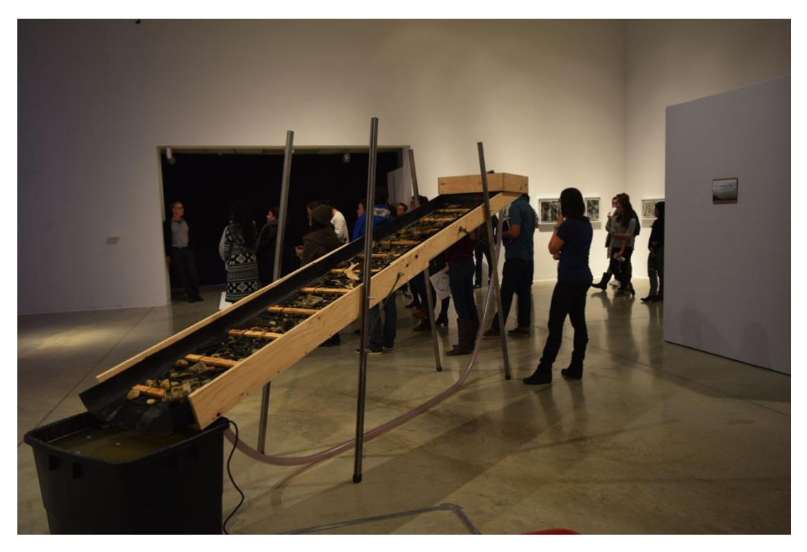
Figure 7. Esteban Ayala, Prospecting , wood, plastic, metal, water, water pump, sand, stones and elements from Portovelo's Yellow River, 400 x 64 x 200 cm, 2016.

On the wall next to his installation was a digital photograph illustrating an almost idyllic countryside of the mountains surrounding Portovelo, taken from the neighboring Zaruma. Yet the following inscription completes the message and brings the viewer to a harsh reality: "El oro en realidad no lo ha visto jamás ninguno" (Gold indeed has never been seen by anyone) (Figure 8). The installation was notable as it appealed to many senses: sounds, smells, and objects that tempted the viewer to actually touch them. The viewer's presence completed the work as a movement detector activated water that ran through the metallic structure. Sand, stones, bones, pieces of ceramic and metal, and other garage-like artifacts were standing there to make a statement on the history of Portovelo and to raise socio-ecological issues at the same time.