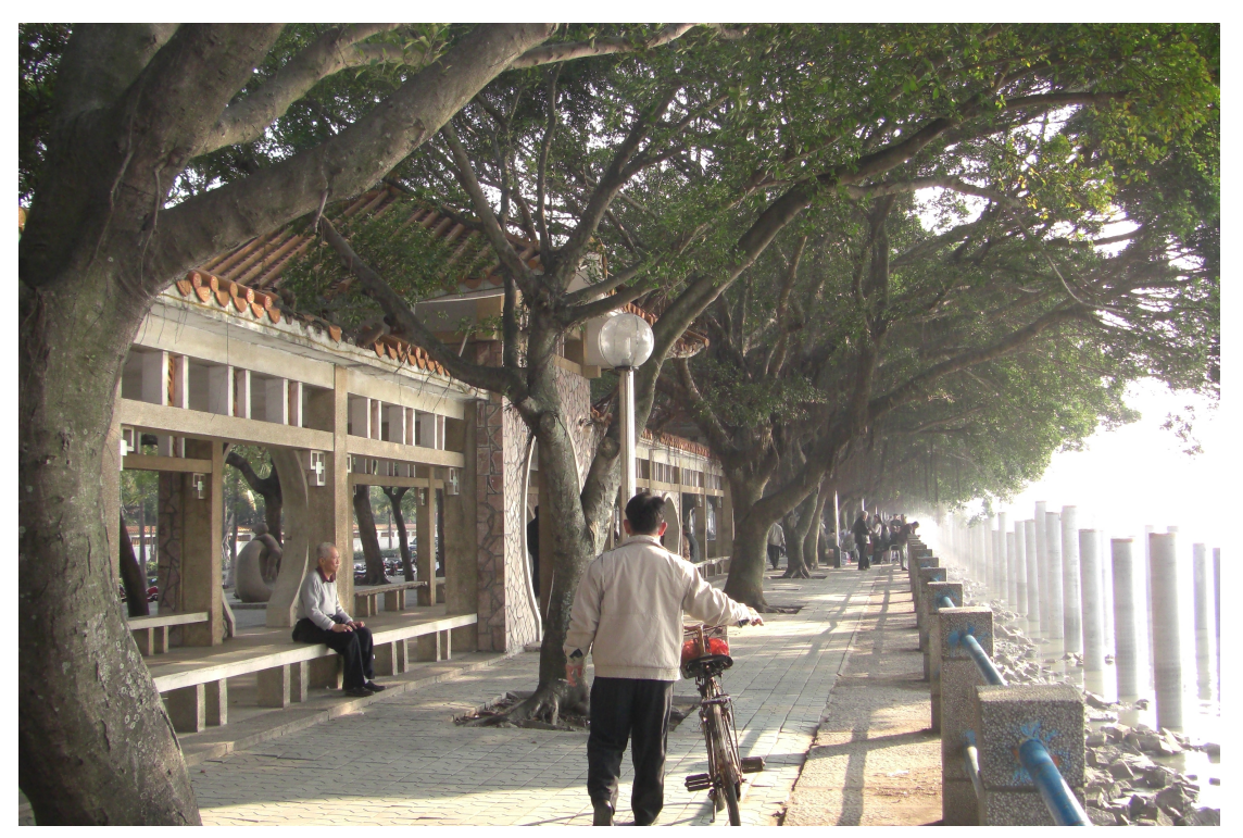
Figure 2. People walked along the promenade at their leisure