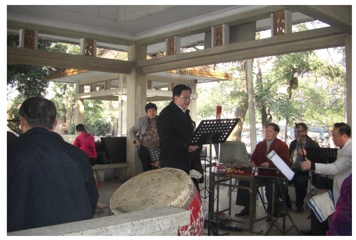
Figure 1. A group was playing and singing Chaozhou opera in public