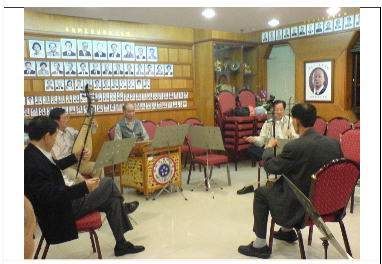
Figure 3. Playing xianshi music as a kind of bonding among members

Therefore, besides having a love of music which draws them together, playing xianshi music also contains a deeper message of mutual assistance. Now, as master Yang said, although in their professions they have changed from being workers to being bosses, they still have a sense of belonging to the group. In Chinese, we have a proverb: xiangshi yuwei 相識於微 "Knowing each other when we were insignificant", which implies that people especially treasure friendships which were established when they were just "small potatoes", rather than those they make when they are rich.